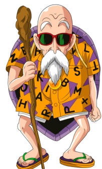
9. Kame-Sennin ___