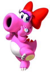
3. Kyasarin ___