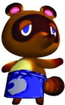
7. Tanukichi ___