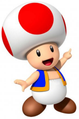
1. Kinopio ___

Can you match the romaji name with the English name?