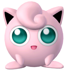
6. Purin ___