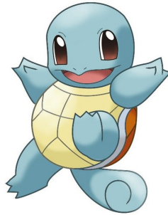
5. Zenigame ___