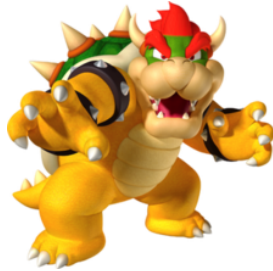
2. Kuppa ___