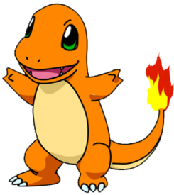
4. Hitokage ___